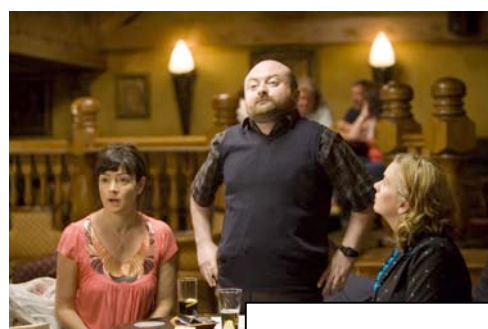
Trivia (Grand Pictures)