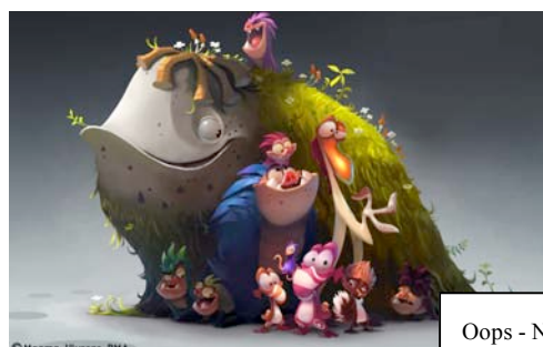
Oops - Noah is Gone! (Magma European Scripting House)