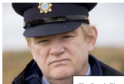
The Guard

The objective of i2i Audiovisual is to support production companies in accessing finance from banks or financial institutions by co-financing some of the costs of guarantees required by such institutions and/or part of the costs of bank financing – Insurance Costs, Completion Guarantee costs and Financing costs.