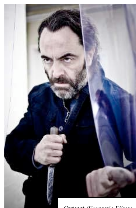
Outcast ( Fantastic Films )

The data published in this Review is based on information provided by the European Commission.