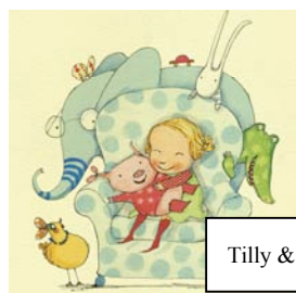
Tilly & Friends (Jam Media)

This funding seeks to encourage independent European audiovisual production companies to produce work (fiction, documentaries or animated films) that involves the participation or cooperation of least three broadcasters -and preferably more- from several member states.