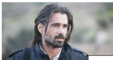
Triage (Parallel Films)