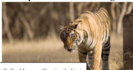
Broken Tail's Final Journey ( Crossing the Line )

Established Production companies with an international track record can apply for support for a Slate (Package) of projects. Production companies who already have a Slate Funding Agreement may be able to apply for 2nd Stage Slate Funding support.