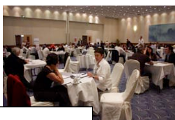
Galway Film Fair

This scheme supports organisations that propose events and activities (including computer-based information tools) designed to promote European audiovisual works and facilitate access to markets for European professionals.