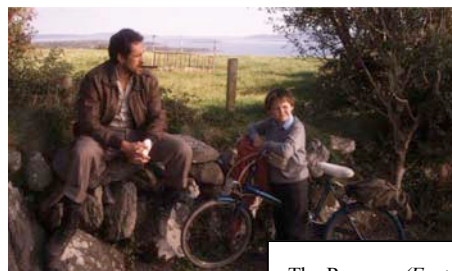
The Runway (Fastnet Films)

MEDIA Desk Ireland is an initiative of the MEDIA Programme of the European Union in co-operation with the Film Institute of Ireland, Film Makers Ireland, Dublin City University, Film Base, Bord Scannán na hÉireann/Irish Film Board and Raidió Teilifís Éireann.